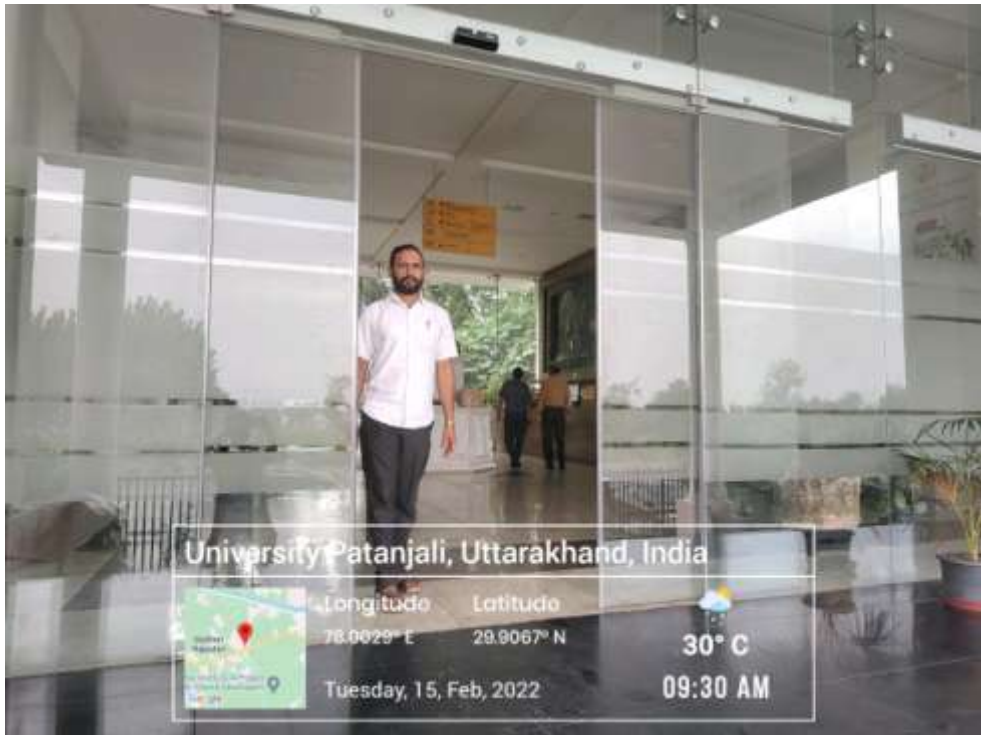
A research scholar in front of sensor based gate