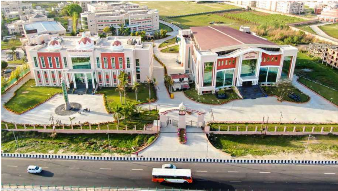
Arial view of campus