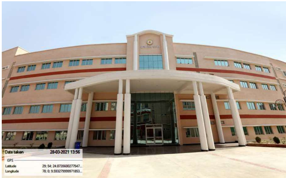
Faculty of Oriental Studies