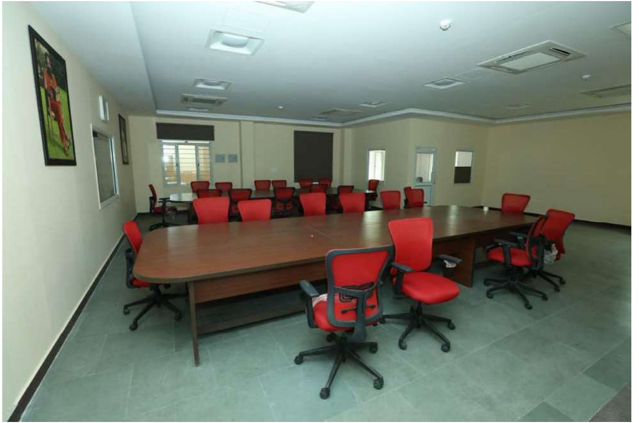
Separate Exam Cell