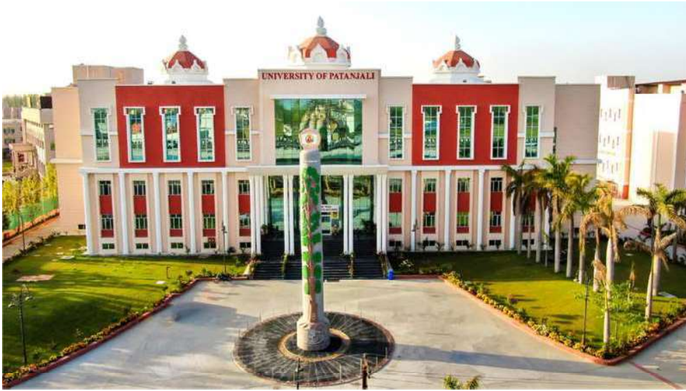
Front view of Admin Block