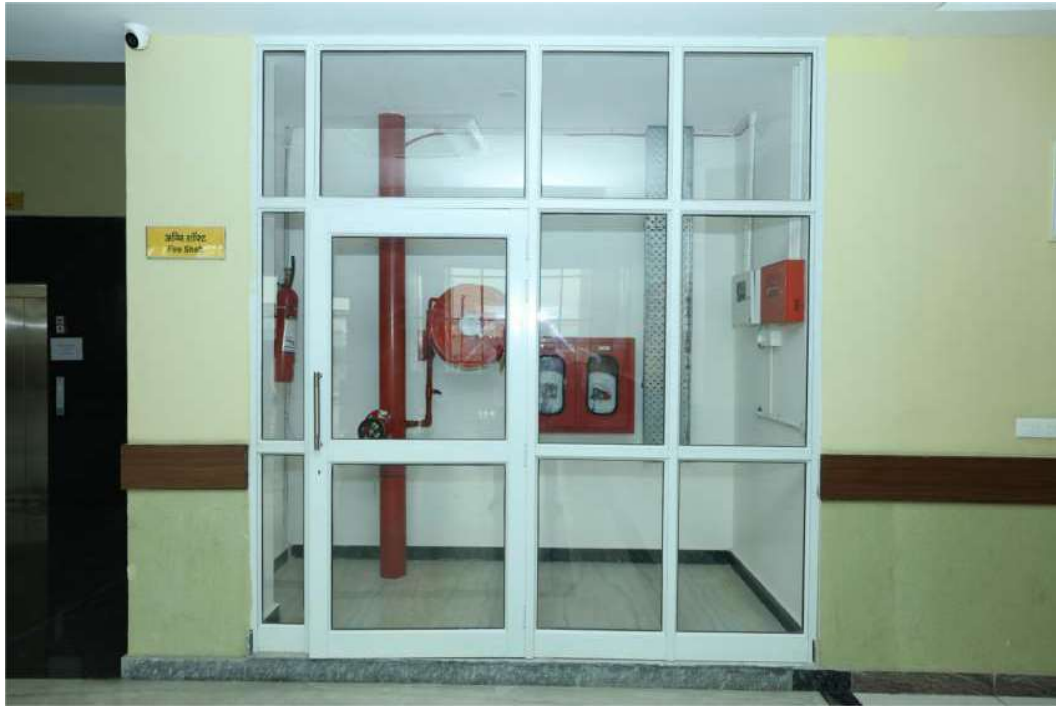
Fire Fighting System