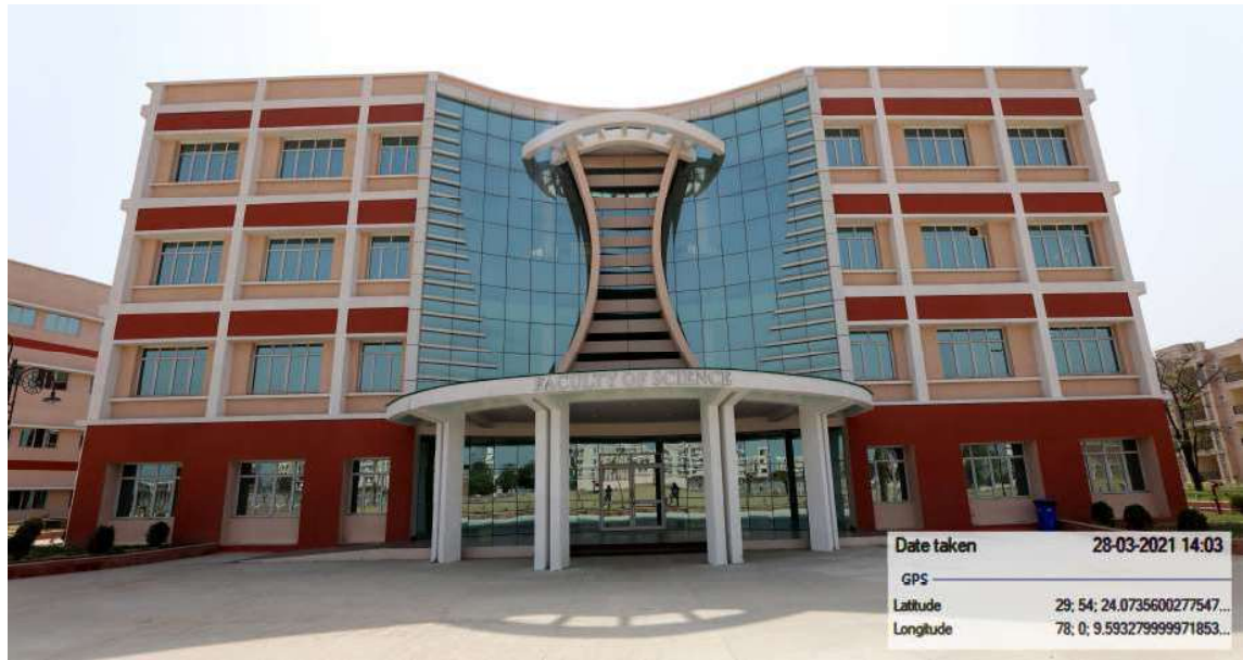
Faculty of Science