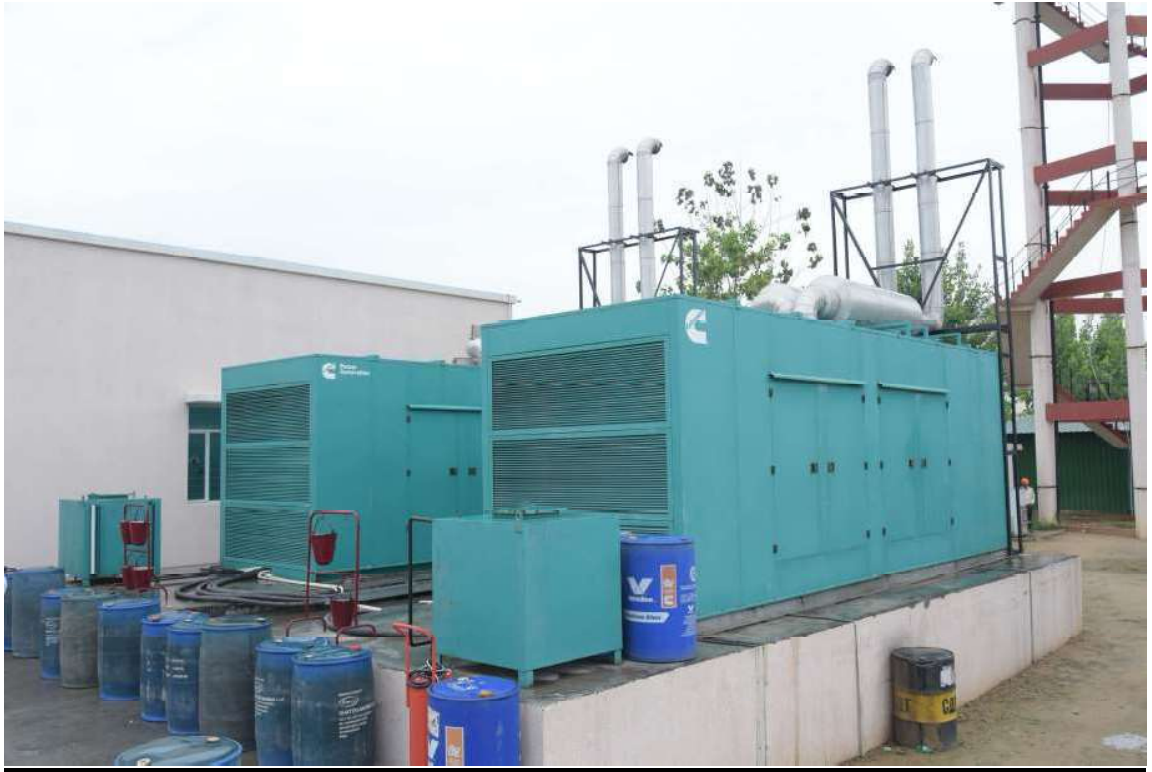
Power Backup System