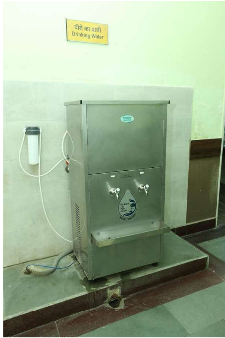
Drinking Water Facility