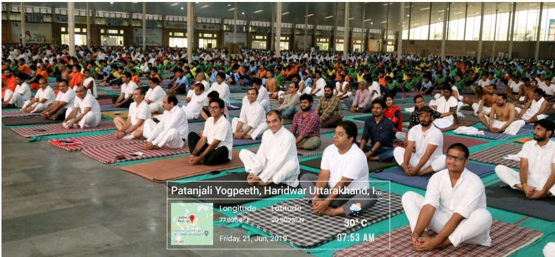
Mass yoga activity for the public of Rajasthan by University faculty and students