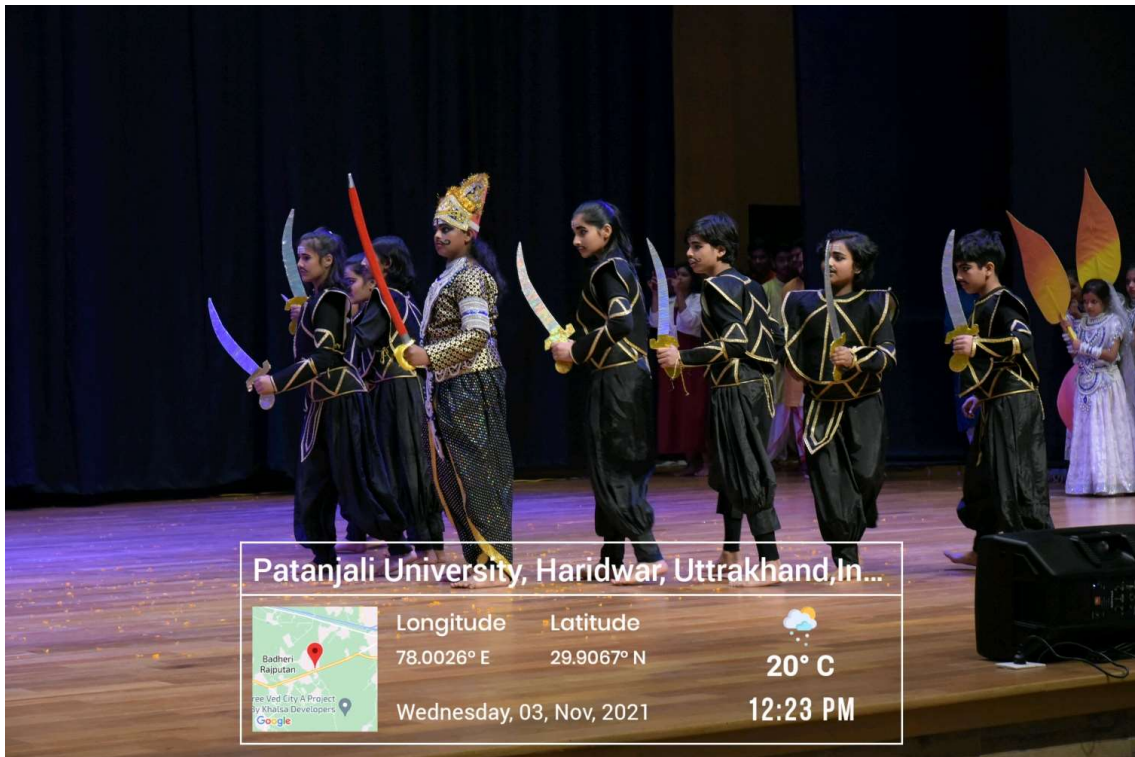
Public awareness through cultural program by the students of University