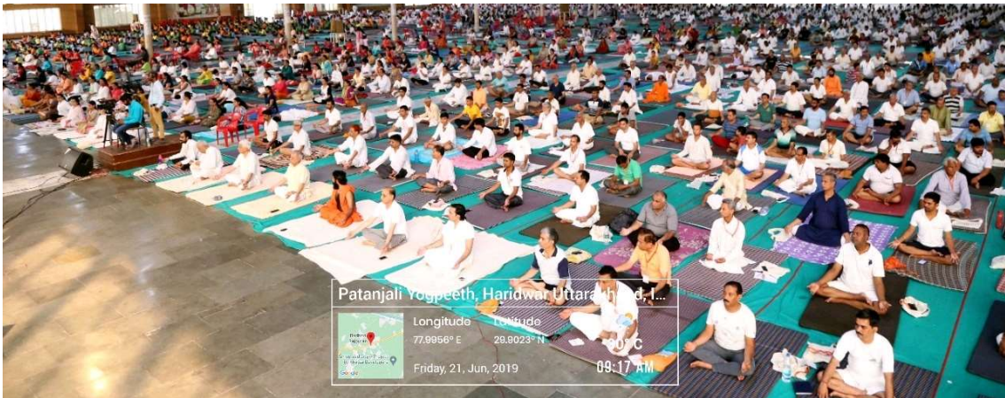
Mass Yoga activities for the Society