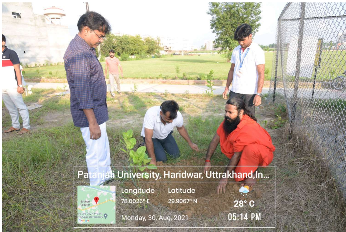
Tree plantation activity by the students of the university