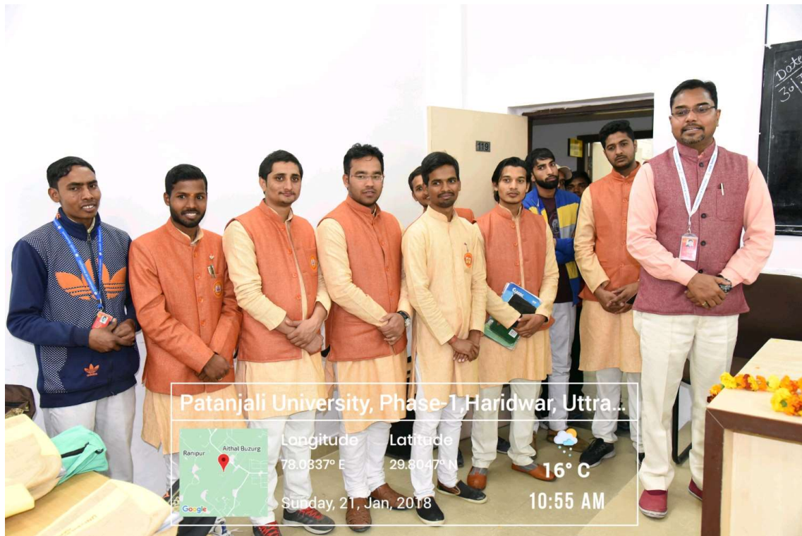
Mentoring session for the scholars of University.