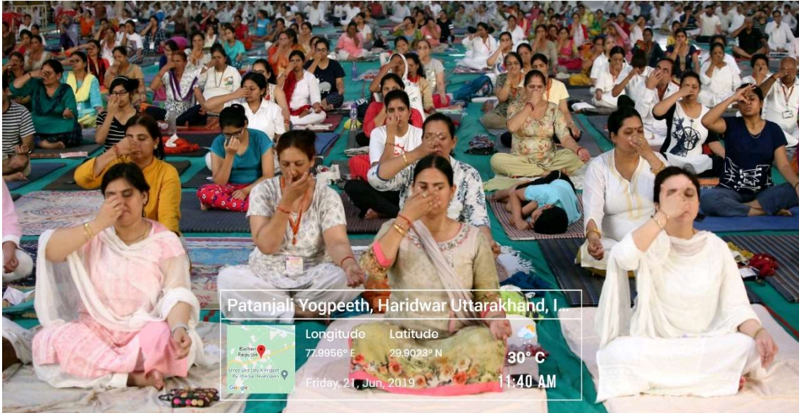
Mass Yoga activities for the Society