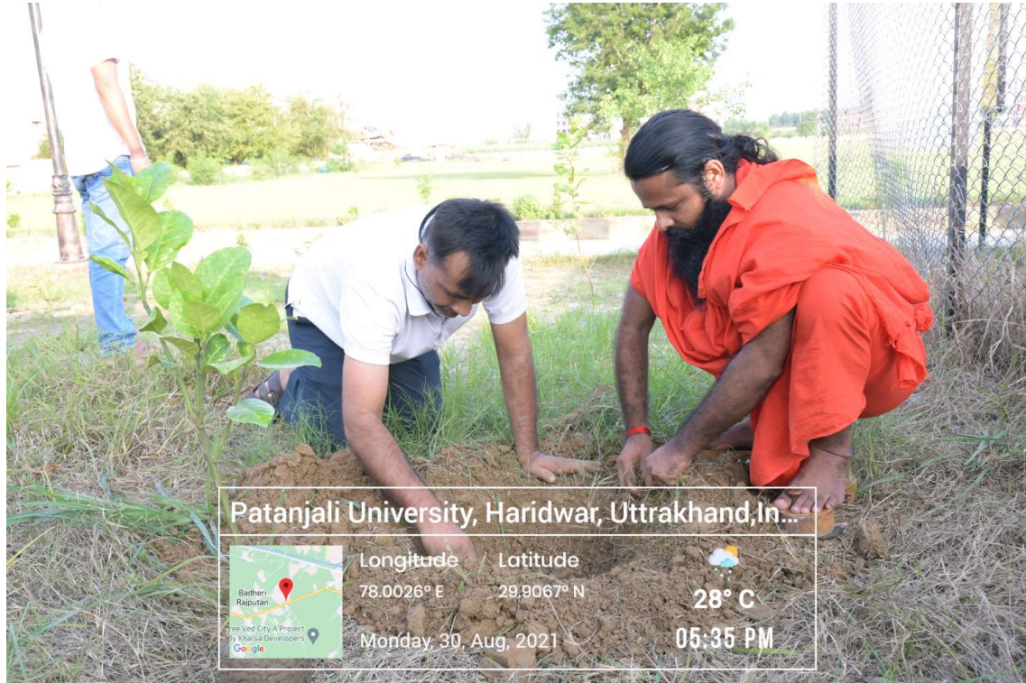
Tree plantation activity by faculties of University