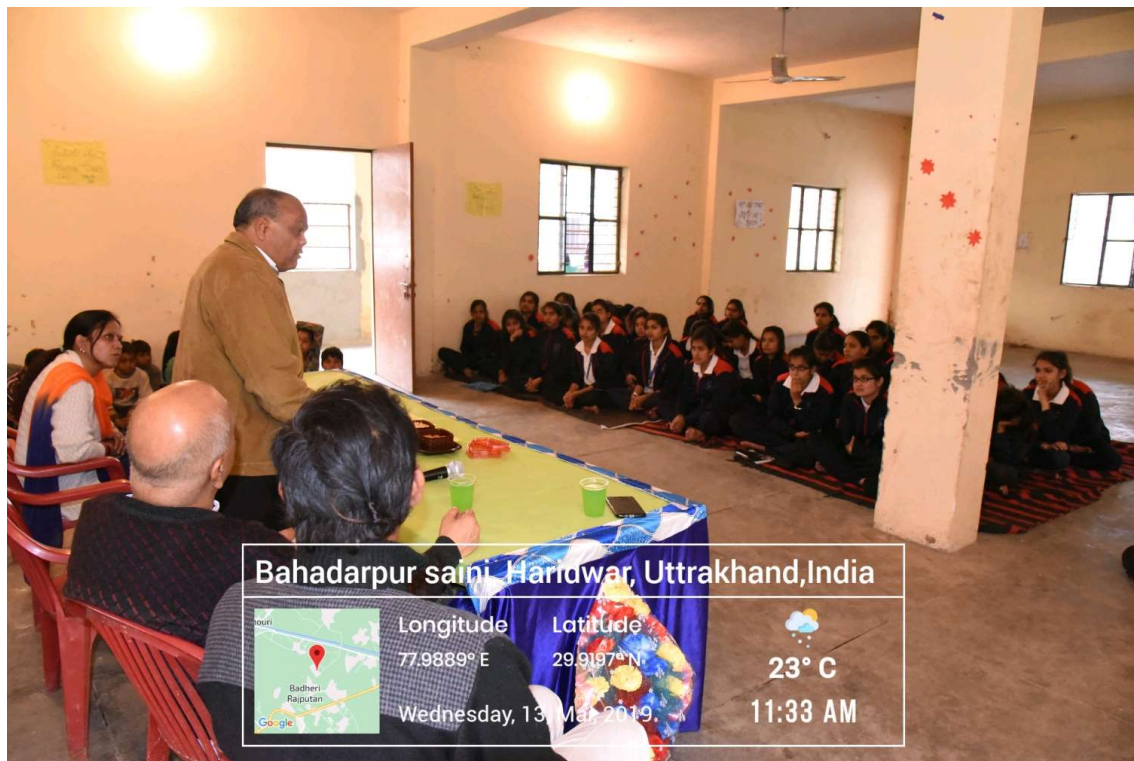
In house NSS activities conduction for the students of University.