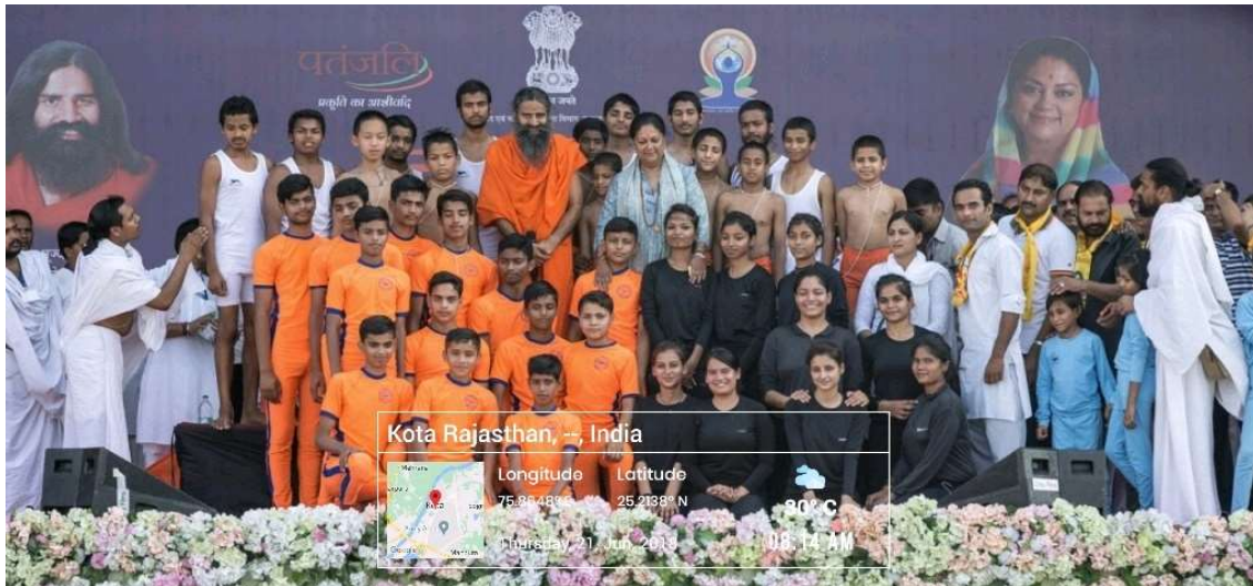
Demonstration of Yogasana Activities during yoga camp for the society