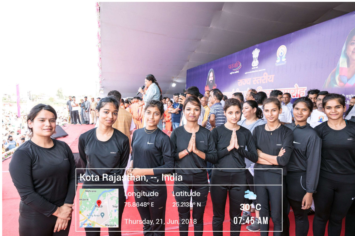
Awareness program by the students of the university for the Audience present in auditorium