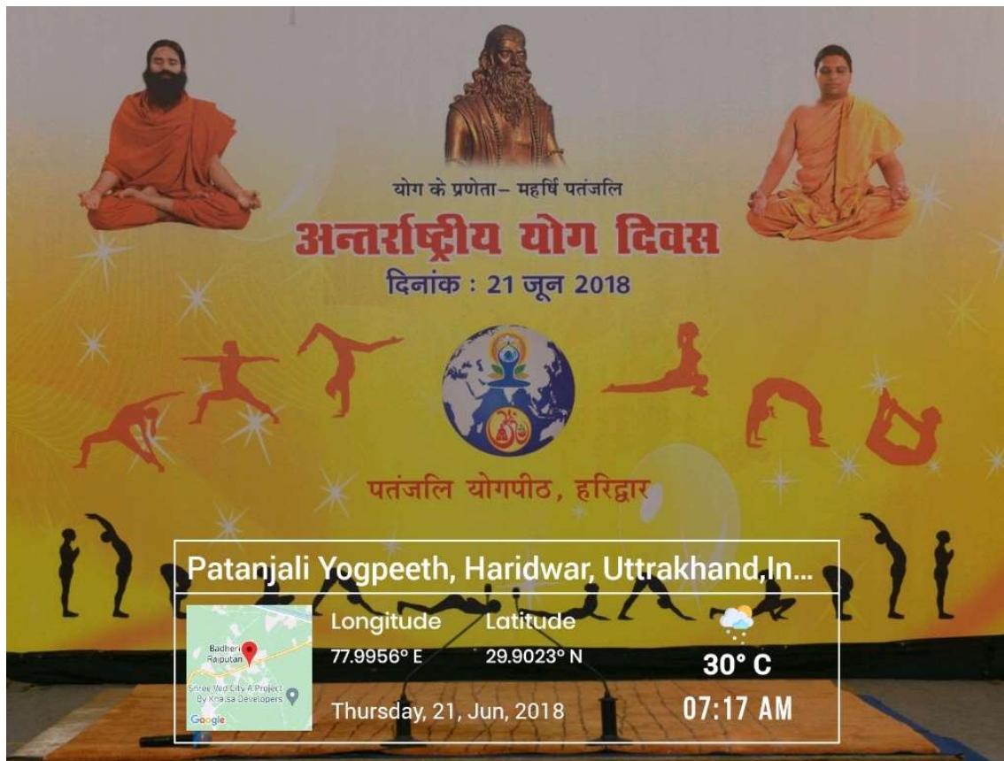
Celebration of International Yoga Day at Patanjali Yogpeeth