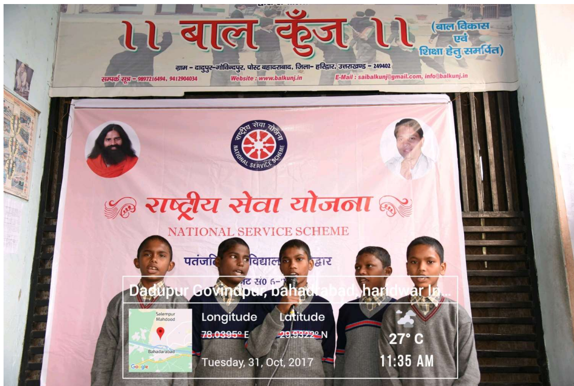
NSS activity by the students and faculty of the university at BalaKunj, Haridwar