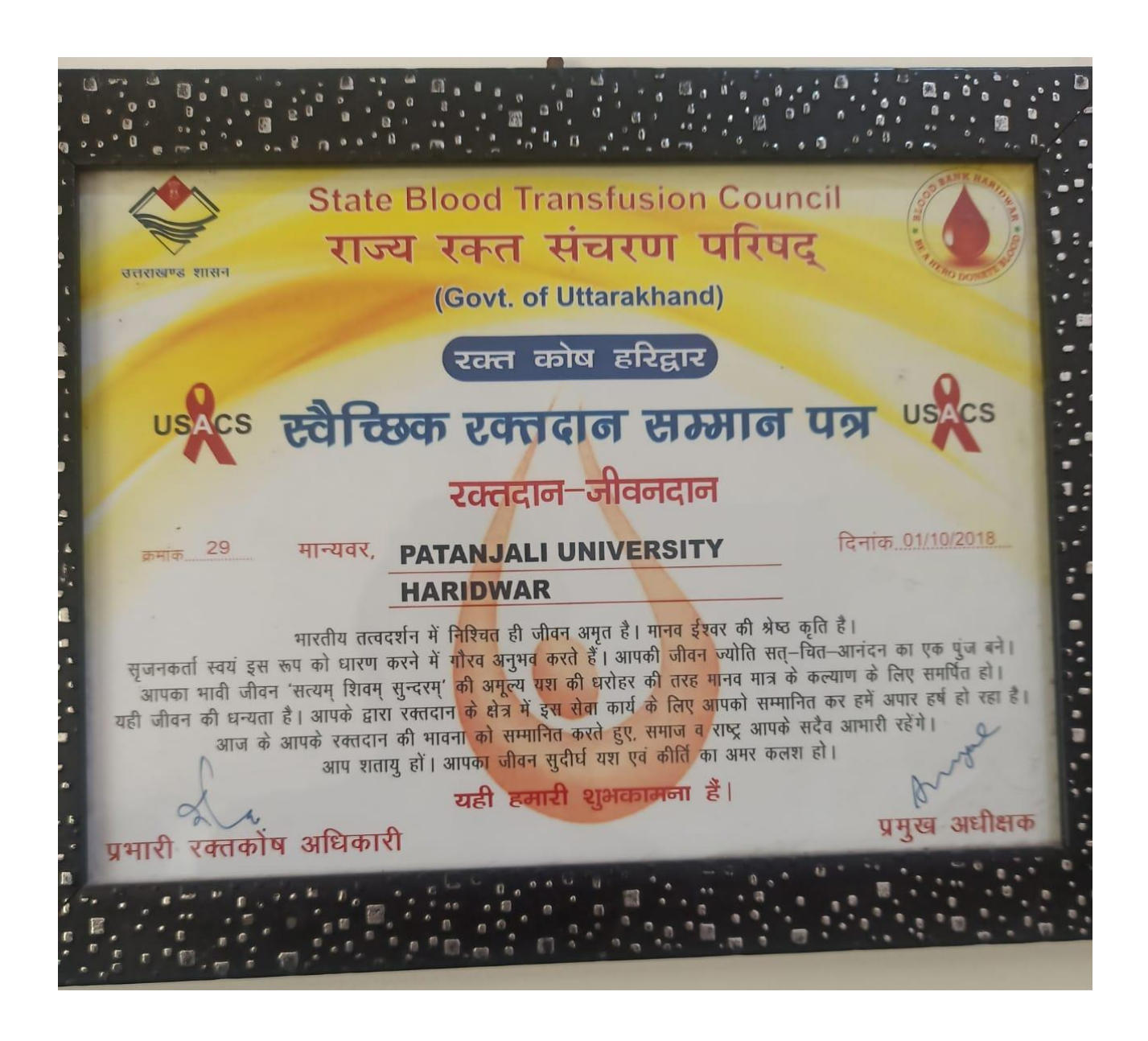
Honour Certificate for organizing Blood Donation Camp