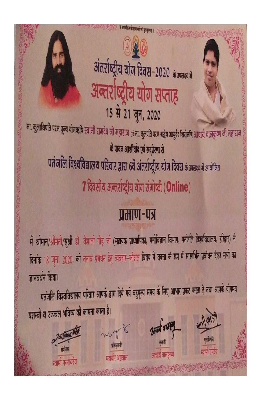
Guest Speaker on International Conference