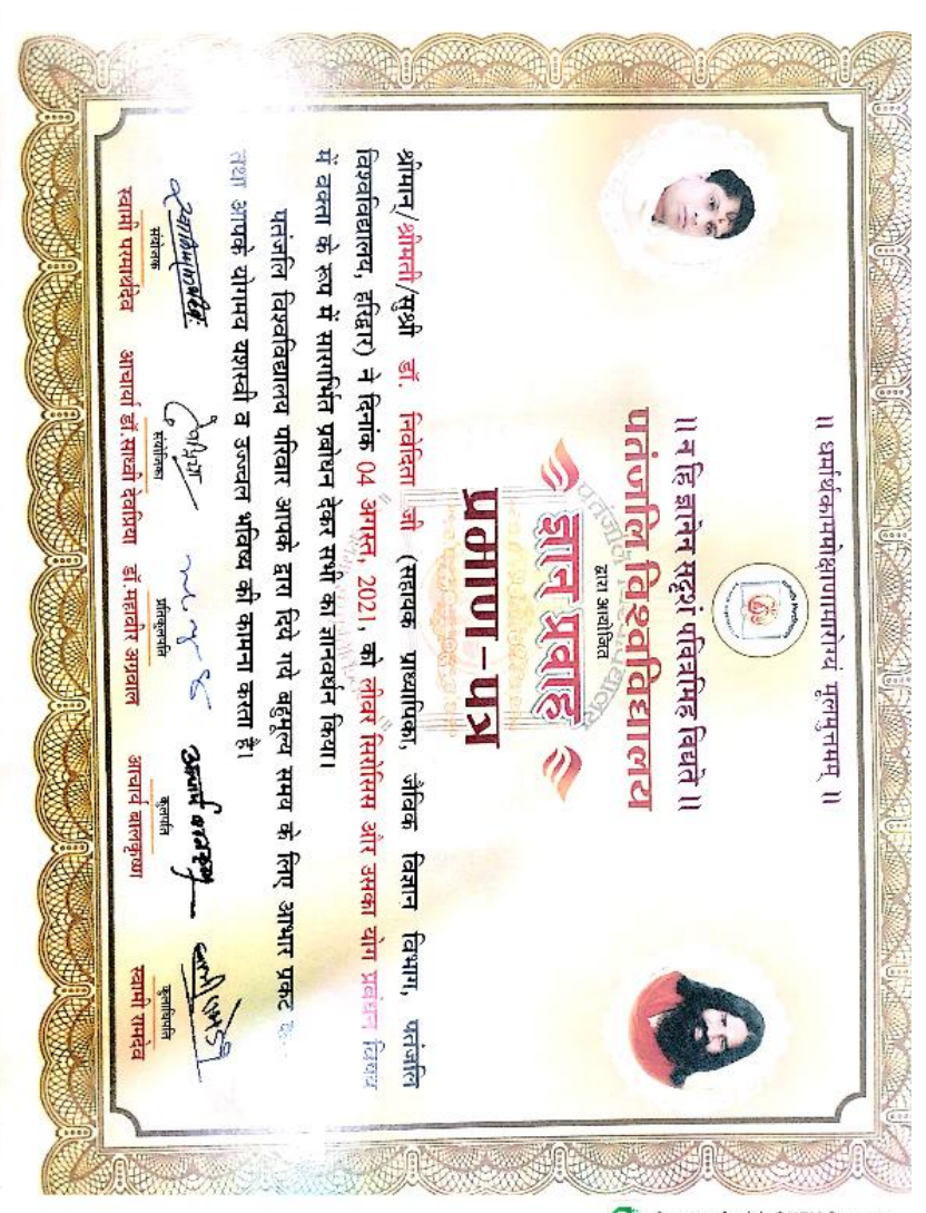
Scanned with OKEN Scanner